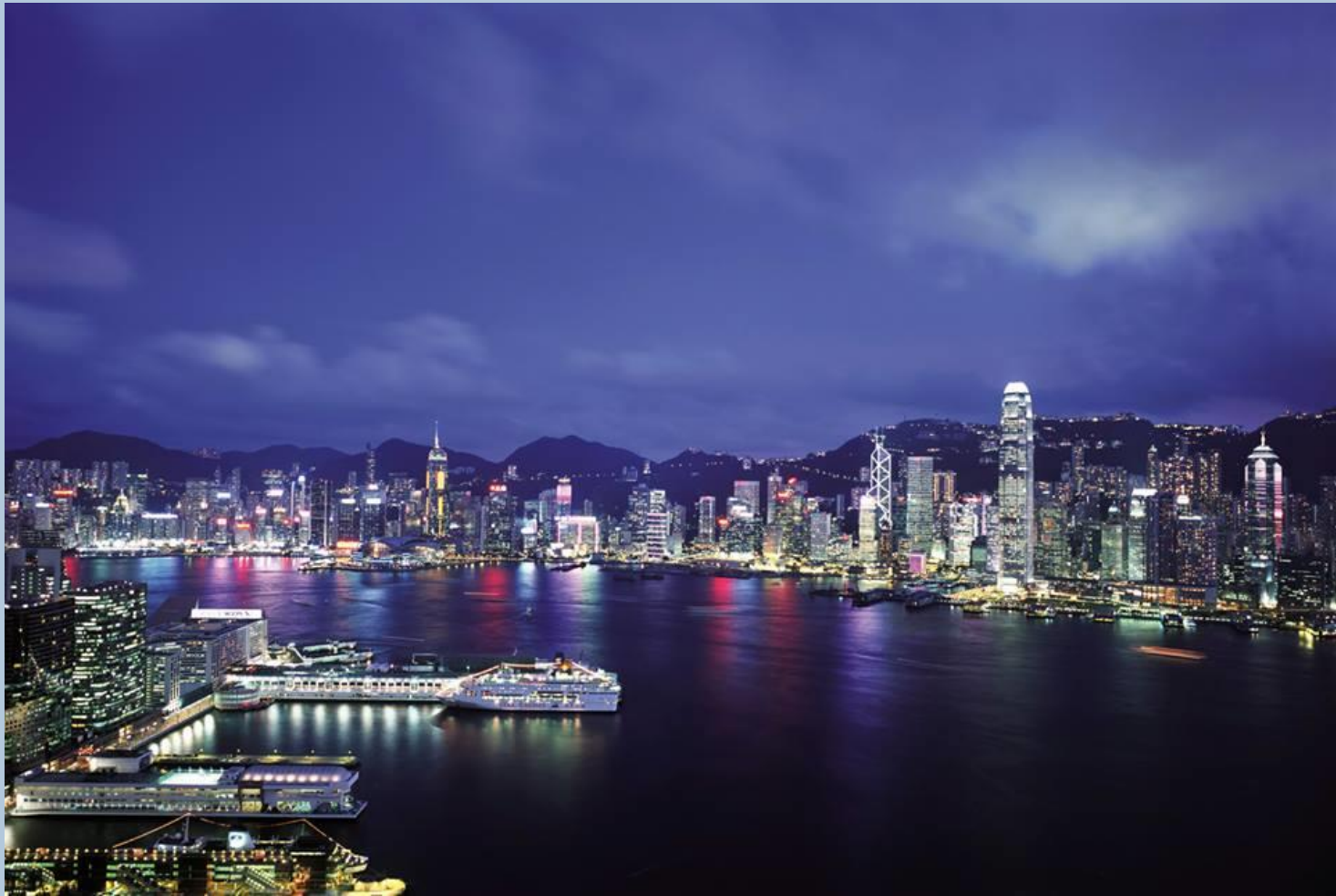
Victoria Harbour View