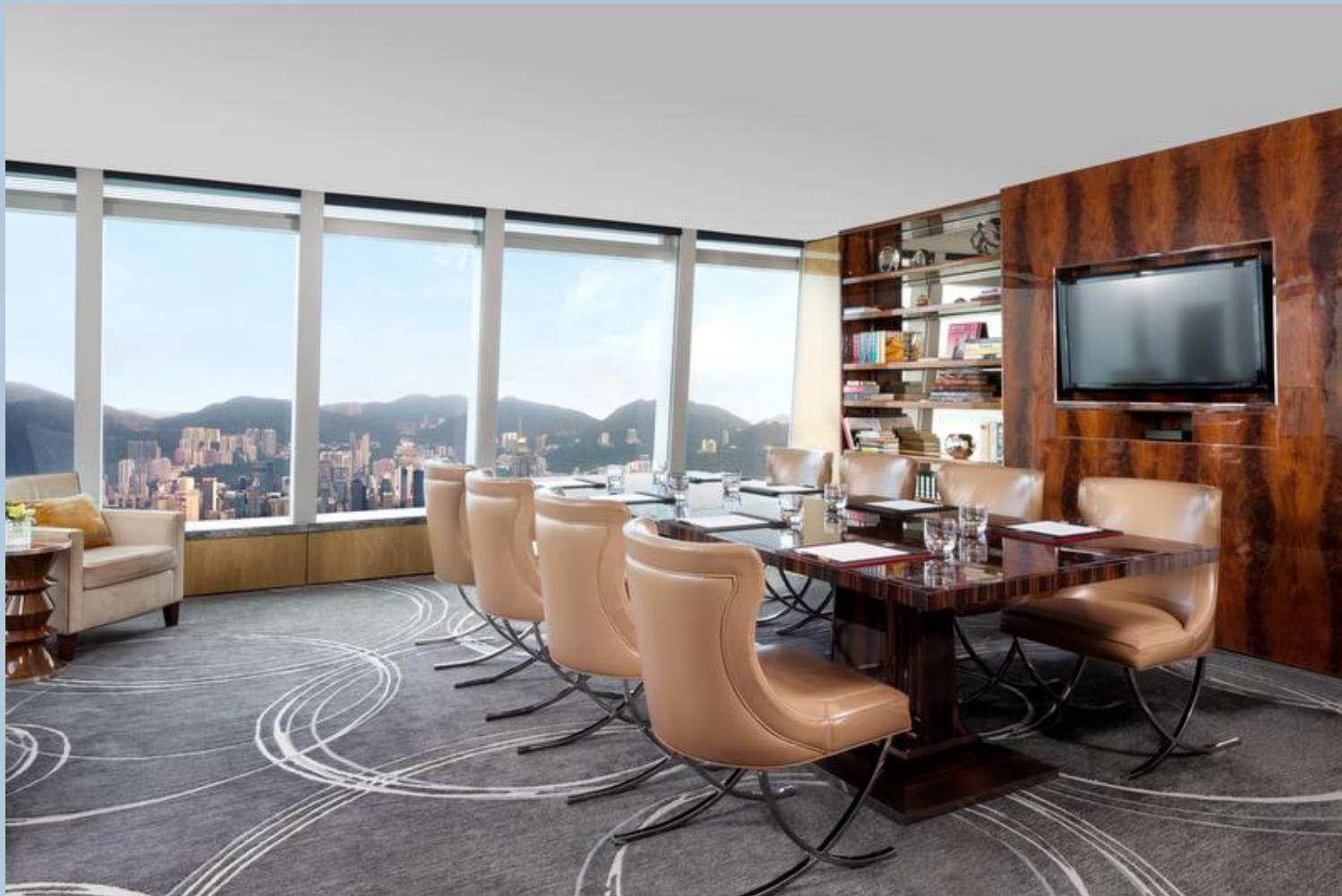
Exclusive meeting room at Club Lounge